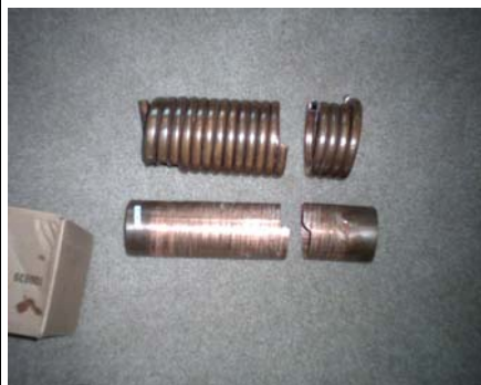
Fig. 4(a) Drainpipe & removed coil from Vaughn G3-12. Found no incise mark on coil or drainpipe.