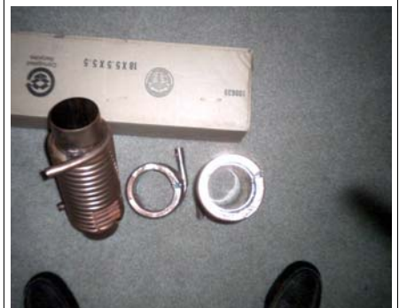
Fig. 4(c) Same arrangement as 4(b).