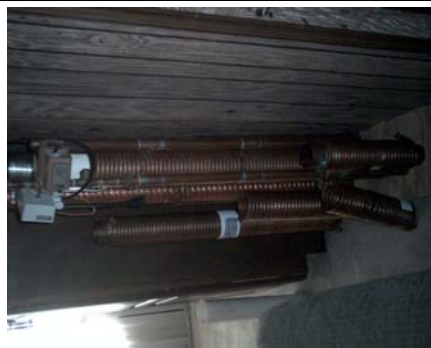
Fig. 5(b) Same group as 5(a).

Figures 5 (a) & (b) show four UL-certified GFX's including: (1) Doucette Power-Pipe G3-40 Knockoff, (2) Doucette S3-60, (3) Vaughn infringing Model GFX-M3-52 (used as GFX-Star Prototype); (4) Smart Drain G3-30; FCCI G3-19 (Reject). Also shown: Watercycles S3-58-LC 1 , 39-turn Doucette coil with no incise mark, 21.5-turn Vaughn coil with incise mark print string stating "1/2" MGTP-N-NSF 61 - Type L", but no point-of-origin given.