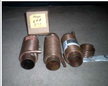
Fig. 1 Three G3-12 GFX's; 2 by Vaughn, 1 by Doucette (Right). No visible marks as required on ASTM B88 coils & B306 DWV drainpipes.