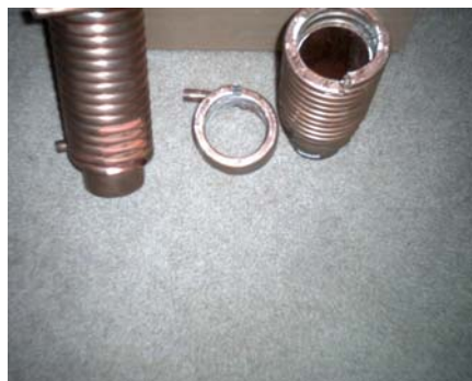
Fig. 4(b) Cut & intact Vaughn G3-12's. No continuous yellow stripe on 3" central DWV drainpipe.