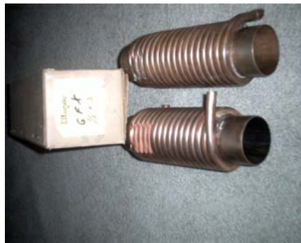
Fig. 2 Two Vaughn G3-12's before coil Removed from lower unit.