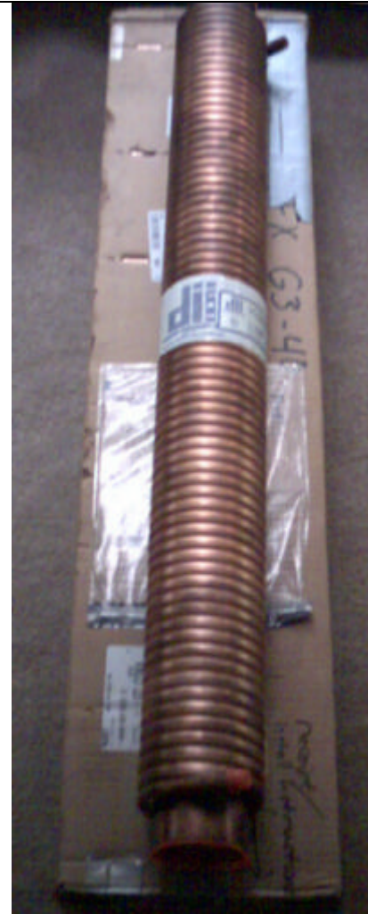
Figure 1. Power-Pipe lying on shipping carton from Canadian IP-Thieves