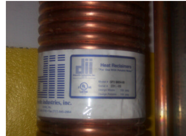
Fig. 3 DII label having (i) No mandatory notice of US Patent #4,619,311, (ii) No trademark, (iii) a Canadian-US UL Certification Mark above “LISTED” & UL’s Control #31PN for File MJAT7.MH26850 on an UNLISTED Model M4S4-60 GFX.

Notice printed at lower right: “Maximum Working Pressure 150 lbs.” For Use With Potable Water PATENT NO 4,619,311