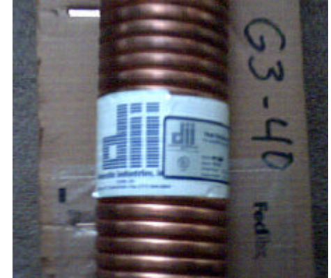
Figure 2. Blow-up of Doucette Label on Power-Pipe; no patent notice mandated by Article 8.1. Label reads: Model # GFX3-40