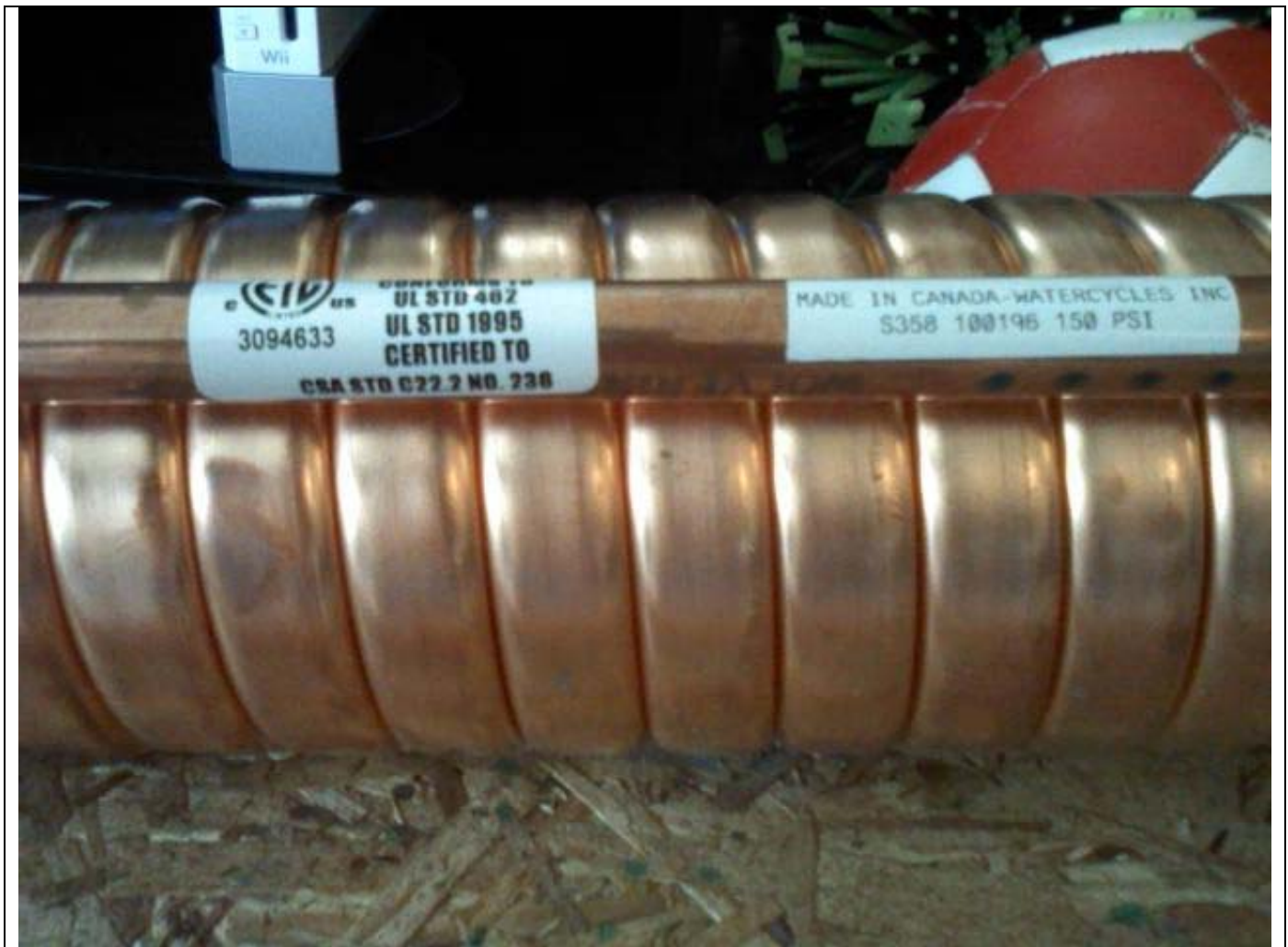
Fig. 1 Photo showing ETL labels on one of 3 substandard Watercycles' GFX's with no incise mark o coil.

NOTE: Unlike UL, which failed to prosecute and de-list Renewability after consumer complaints made by more than one Canadian @ www.gfxtechnology.com/T-Hug.pdf , www.gfxtechnology.com/H-Hack.pdf & www.gfxtechnology.com/C-Mart.pdf , Intertek revoked Watercycles Energy Recovery Inc.'s privilege to used their ETL safety-certification mark, effective October 8, 2009, but as of 12/11/09 has not issued recalls or notified consumers whether or not Watercycles shipped units safe for use with potable water -- even after its President admitted importing copper tubing from Mueller Streamline having no permanent NSF-61 Incise Marks or third-party certification marks like Intertek's Warnock-Hersey Mark. He also admitted using ACR tubing, which cannot be certified for use with drinking water. (See confirming email excerpts in Footnote #1.)