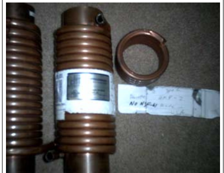
Fig. 3 Doucette GFX/PowerPipe & Coil Section. The latter has no ASTM B88 or ANSI/NSF-61 mark; only the following incise mark: "1/2" Type L HMP-Z MADE IN USA".