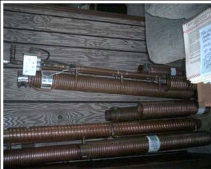
Fig. 5(a) 8 assorted GFX's & coils.