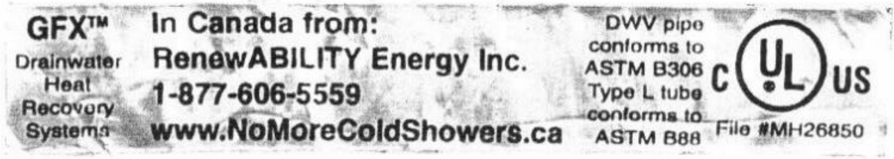
Fig.1 Blow-up of Counterfeit REI/DII Label brought to US from Canada on 3/4/04.